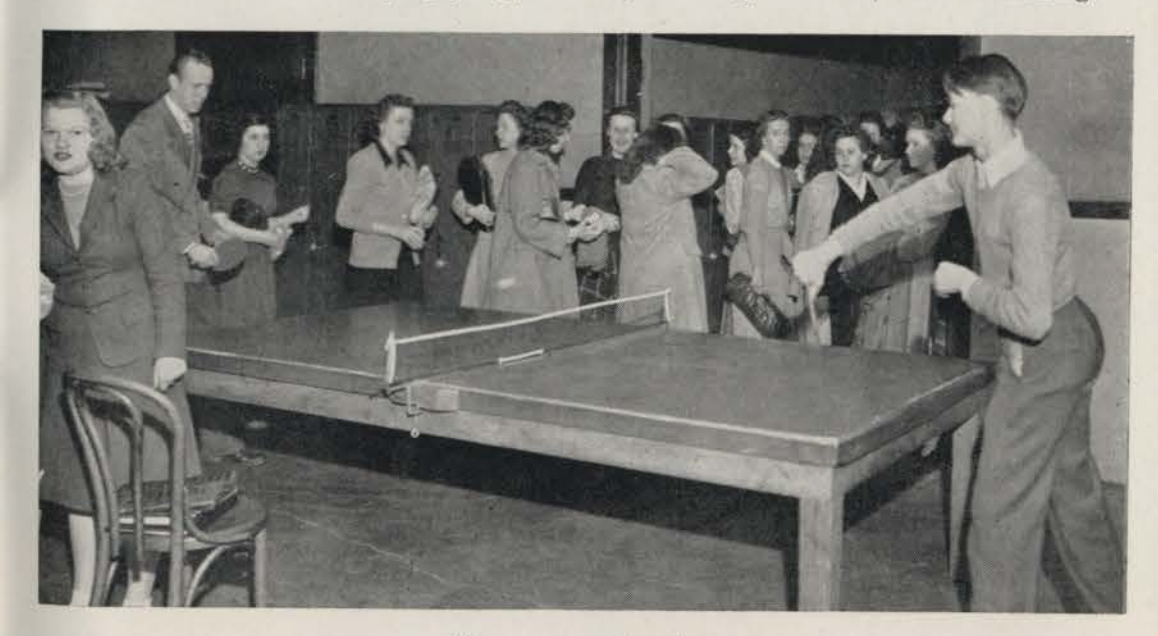
Always a popular place