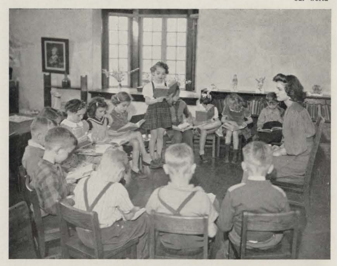
Hope of our new world