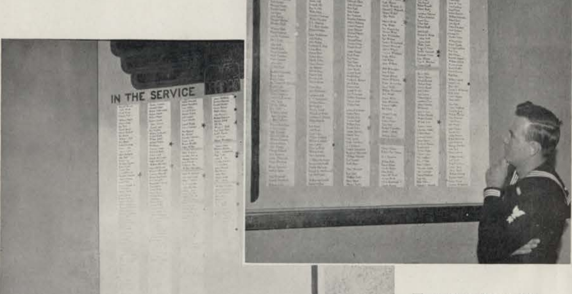
The Service Honor Roll now contains almost 900 names.

always find a welcome at J. C. Under the provisions of the G. I. Bill of Rights some have already enrolled to continue education interrupted by the war.