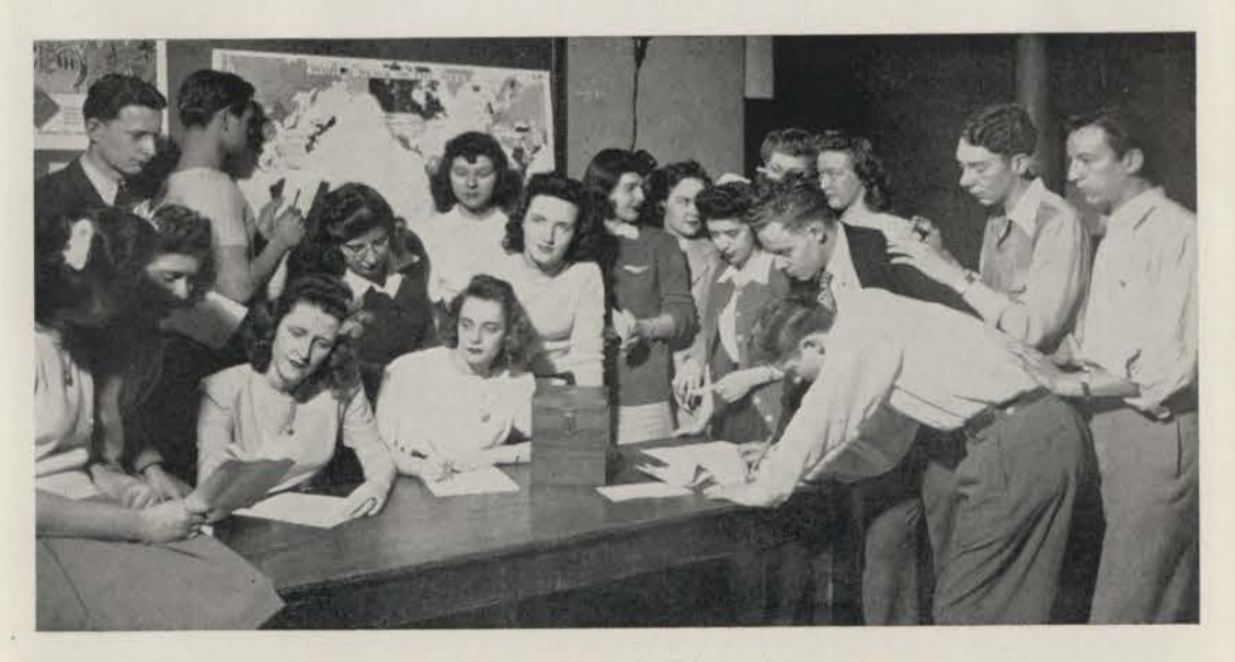
Democracy characterizes J. C.'s activity program