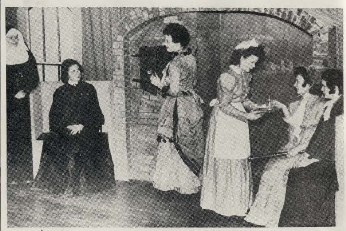
All-school play, "Ladies in Retirement"

THEATRICAL PRODUCTIONS at Junior College are a means through which talent is discovered and developed. Dramatic activities include several convocation programs, and reach their climax in the all-school play.