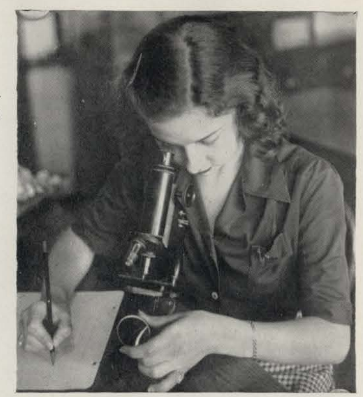
Training for interesting work

students receive thorough pre-professional training