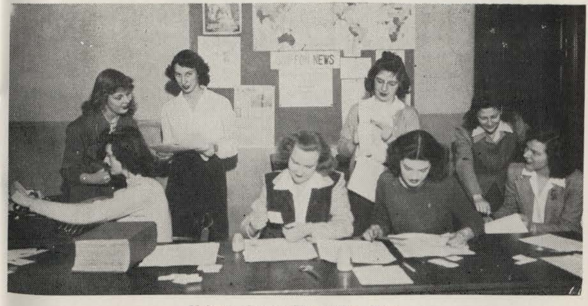
Make-up day on The Griffon News