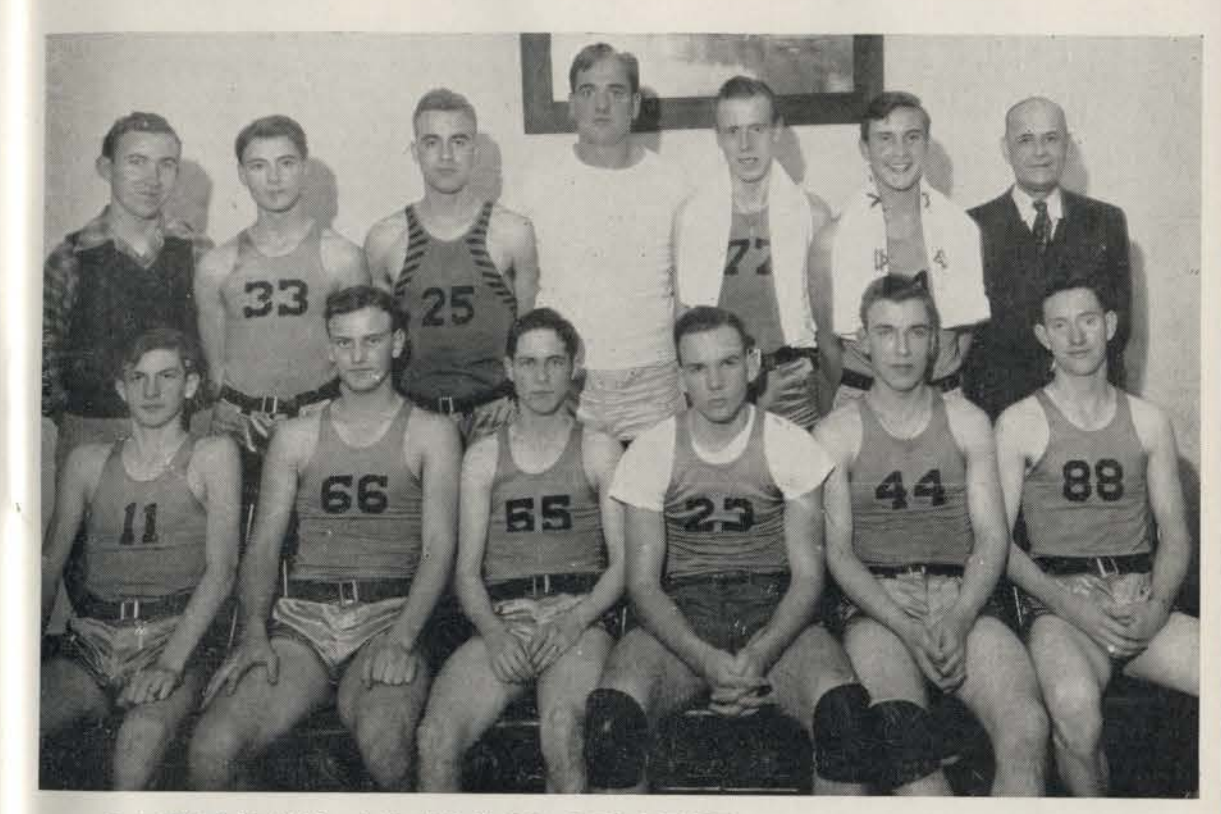
BASKETBALL AT JUNIOR COLLEGE has continued in spite of the war, the team this year having played one of its heaviest schedules. A large percent of the student body takes part in the intramural progam which includes ping-pong, tennis, bowling, softball, and swimming.

The college encourages the formation of interest groups such as the Dramatic Club, the Psychology Club and the Natural Science Club. Membership in all Junior College clubs, where not open to all students, is based upon talent or proficiency in a particular field.