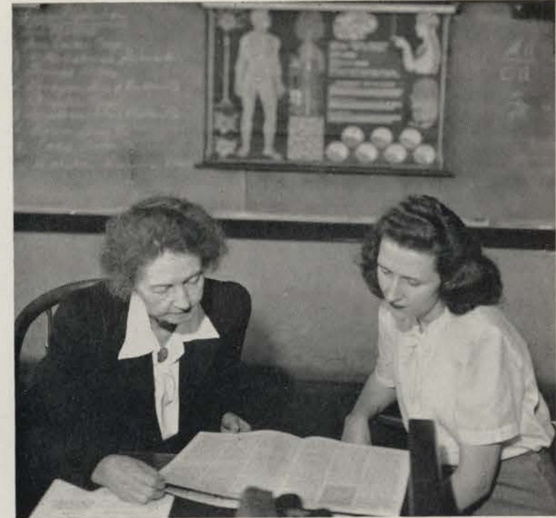
Difficulties are ironed out in conference

The opportunities to develop our individual abilities