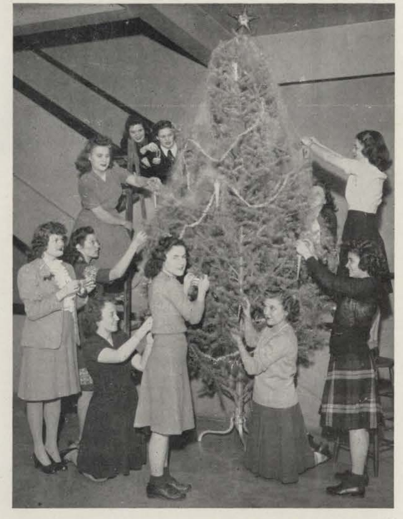
The fragrance of pine in the halls

CHRISTIAN IDEALISM is the background of Junior College life. In convocation programs, at the Christmas season, and through the series of pre-Easter services students have opportunity for religious expression.