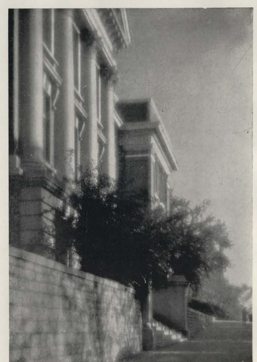
The college building at Tenth and Edmond Streets

WE DISCOVERED that Junior College is more than a building, equipment, and accredited courses. It is a spirit, democratic and friendly. It is an atmosphere, intellectual and stimulating. It is a feeling of belonging.