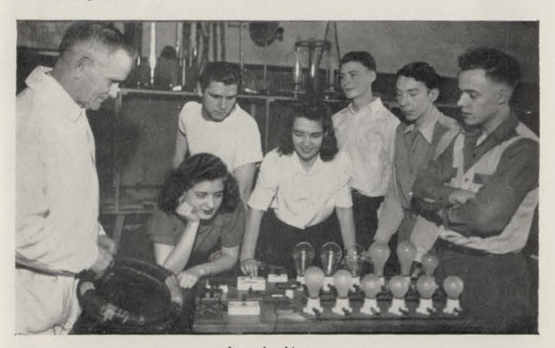
It works this way