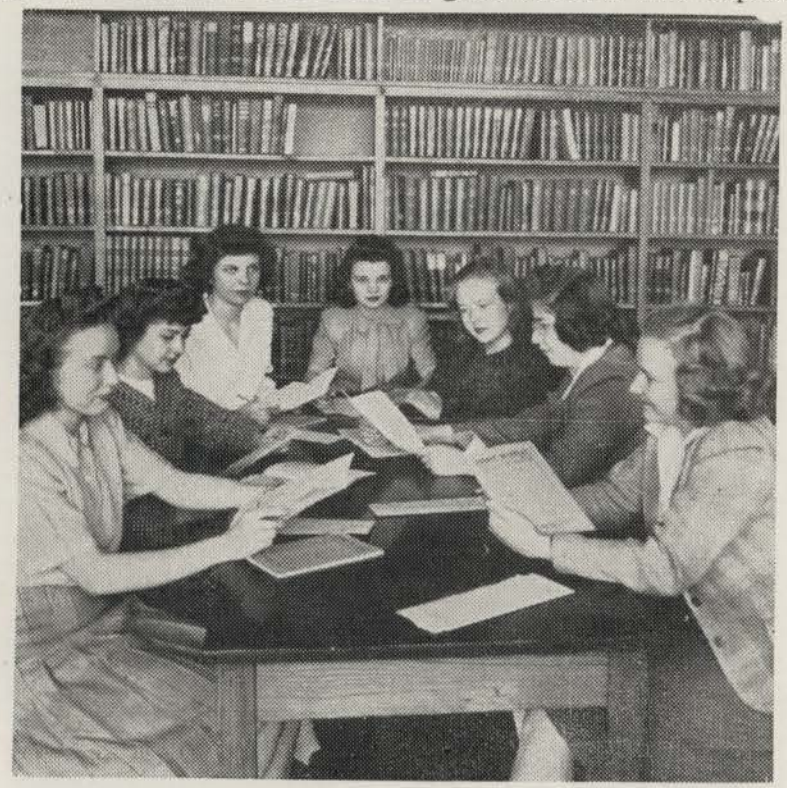
Selecting material for Penny Whistles

to enter schools of journalism practical experience. The students publish The Griffon News, the school newspaper, and Penny Whistles, the literary magazine, which contains the best creative writing of the entire student body.