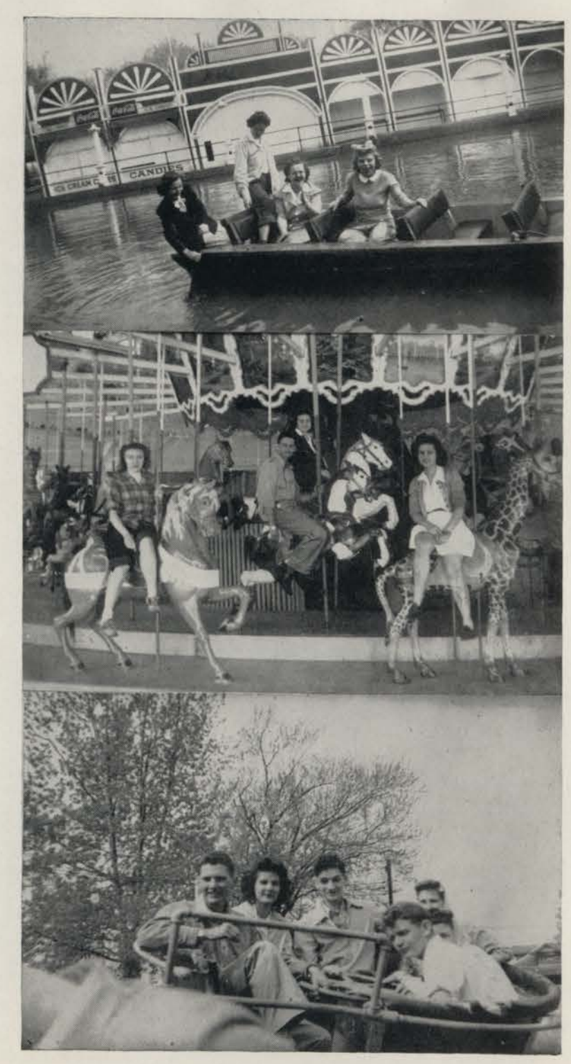
Where but Lake Contrary?